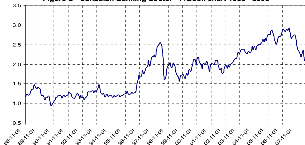
Figure 2 - Canadian Banking Sector - P/Book chart 1988 - 2008

At market peaks and troughs, earnings based valuations can be quite misleading as the cyclicality of earnings makes many stocks appear cheap at the top of the cycle and expensive at the bottom of the cycle. As such, analysts and investors will tend to use more stable valuation metrics such as P/Book, P/Sales and dividend yield to gain a better sense of how expensive or cheap a particular sector of the economy is. In the case of financial services, P/Book and dividend yield are the two most common ways to assess the valuation of the market at peaks and troughs, although even with these two metrics, a certain amount of interpretation is required. The long-term p/book chart for the Canadian Banking industry is presented below.